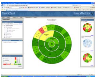
Summary Chart w/Thumbnails

The Summary Chart is one of several analysis tools for "big picture" analysis.