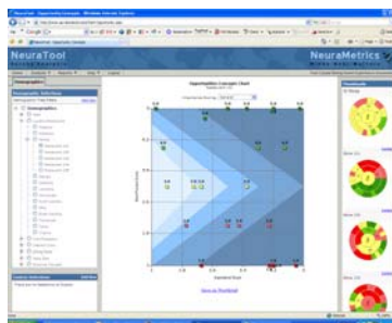
Opportunities Concepts Chart

This chart allows management to focus on channeling investment into areas that have the largest potential for immediate improvement